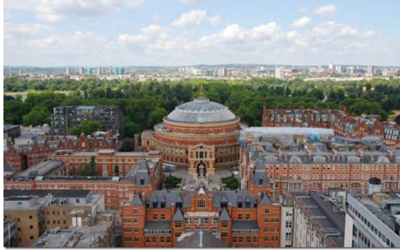
Imperial College London and the Royal Albert Hall