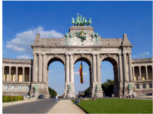
Triumphal Arch .... near the DYMAT venue

the DYMAT website. Membership is open to all who are interested in dynamic properties of materials.