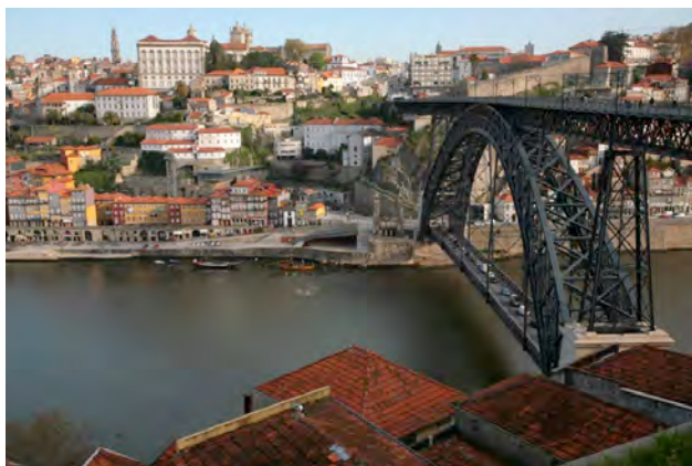
The Bridges and Old Town of O Porto

Website – http://paginas.fe.up.pt/~iccs16/index.html