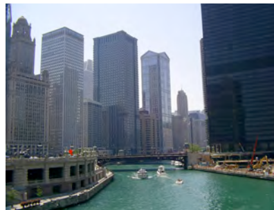
The famous river view of Chicago

theory and simulation of energetic materials and shock loaded materials, and energetic material characterization. The research presented range in scale from atomistic to continuum and system level.