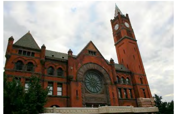
The Union Station, Indianapolis

12th International Ceramics Congress. 6-11 June 2010, and