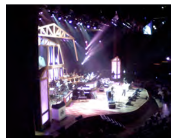
The Grand Ole Opry in full flow...