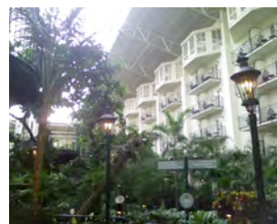
The Gaylord on a quiet evening

everyone, a very large number of people from a multiplicity of organisations, who helped with the conference and for making it a smooth-run operation.